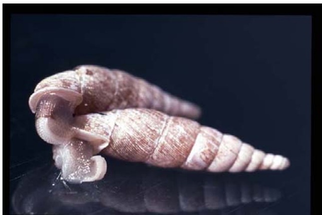
Figure 3 Two mating clausiliid snails. In clausiliids, shell-mounting is normally part of the copulation behaviour. It may allow the registration of shell ornamentation by tactile stimulation of the foot.

the aperture, to facilitate the laying of eggs in the female [29]) or sometimes even by phenotypic plasticity, when the male shell adapts ontogenetically to its substrate, which is sometimes different from that of the female [30,31]. For ornamented land prosobranchs (including Plectostoma ), however, sexual dimorphism has not yet been reported, although the great majority has not yet been studied in this respect. Yet, an absence of sexual dimorphism should not be taken as evidence against sexual selection. As mentioned above, sexual selection may result in sexually monomorphic ornamentation as well.