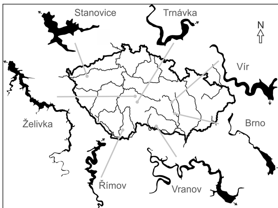
Figure 1 Location of sampling sites in the Czech Republic and schematic outlines of their morphology. A small arrow indicates the position of the dam and outflow of each reservoir. Map modified after Seda et al. [57].

methodological approaches result in comparable patterns see [40].