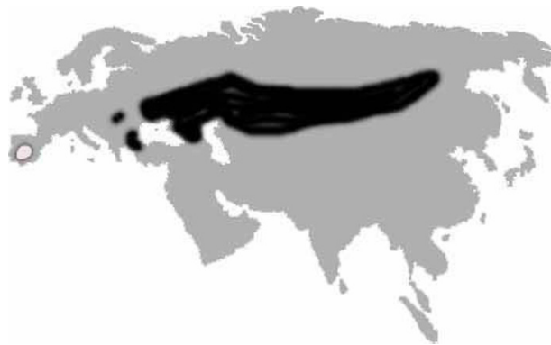
Figure 1 Current worldwide distribution of Spanish and Eastern imperial eagles. The Spanish imperial eagle is confined to the Iberian Peninsula (shaded in light grey), whereas the Eastern imperial eagle has a distribution range through Eurasia (shaded in black).

Estimates of the parameters and values of autocorrelation and ESS (Effective Sampling Size) are listed for the three final runs performed for both sets of markers (Table 1 for mtDNA control region data set and Table 2 for the eight microsatellite dataset). As all runs gave similar results, we report below the estimates from the first run corresponding to the runs which had the highest ESS for the parame-