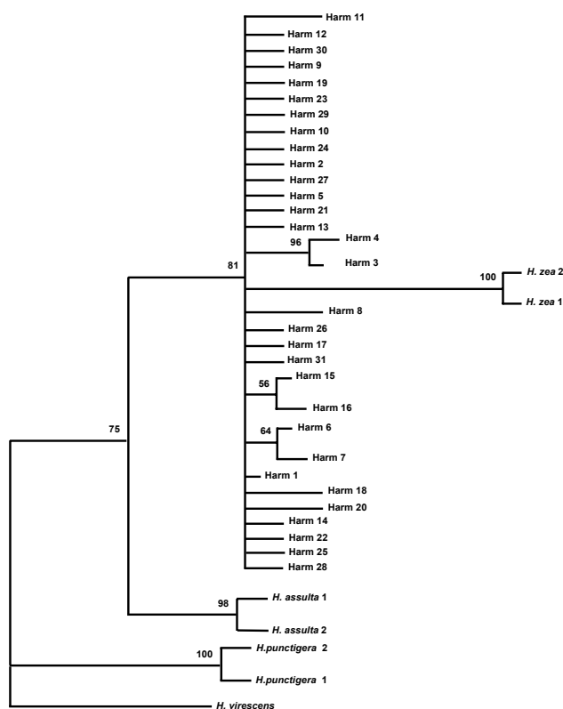
Figure 2 Maximum Likelihood (ML) tree of H. armigera (Harm-1 to Harm-31), H. zea (Hzea-1, Hzea-2), H. assulta and H. punctigera based on partial COI haplotypes sequences. Numbers above the nodes indicate bootstrap support. The outgroup used was Heliothis virescens . The inclusion of additional haplotypes Harm-32, Harm-33, and Hzea-3 to Hzea-11 did not alter the overall topology, and bootstrap values of the ML tree after 1,000 bootstrap replications remained high, with all H. zea haplotypes confidently clustered (bootstrap value = 96) within the H. armigera clade. H. punctigera remained basal to H. assulta (bootstrap value = 99), and the H. armigera / H. zea clade (bootstrap value = 78) shared a most common ancestor with H. assulta (bootstrap value = 97) (data not shown).

species. A monophyletic relationship between H. armigera and H. zea (with low bootstrap support values and limited sample sizes) was inferred based on the nuclear Elongation Factor 1-alpha (EF1- \alpha ) gene [45] and the Dopa Decarboxylase (DDC) gene [46], while a DDC and EF-1 \alpha multi-gene phylogeny also supported monophyly between H. zea and H. armigera with a higher bootstrap value [46].