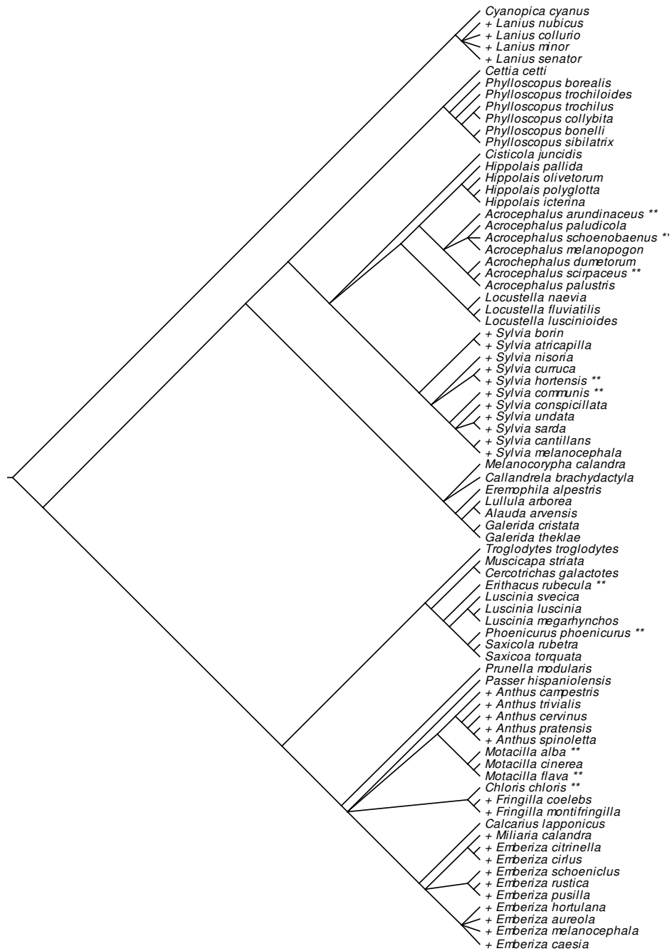
Figure 3 Phylogenetic relationships between suitable hosts of the European cuckoo. See Material and methods for sources. Species with species-specific cuckoo egg morphs are shown with two asterisks after the species names, while those with specialized cuckoo eggs for the entire genus are shown with + symbol before the species names.

and, therefore, our results are the first to support this hypothetical relationship.